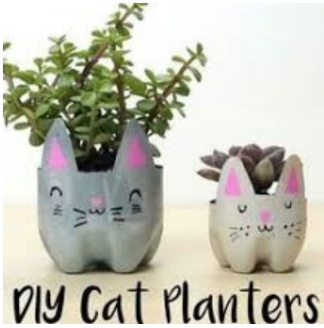
Diy Cat Planters